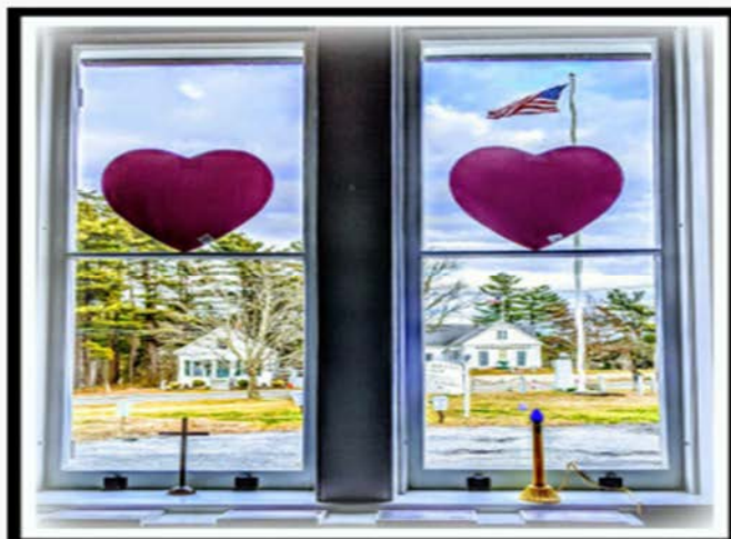
Inside the Church Narthex looking out through antique glass windows

First Church In Pembroke Supports HealthCare workers and First Responders