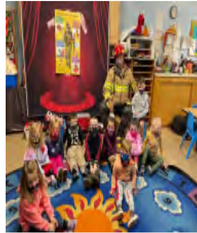
Fire safety from the professionals