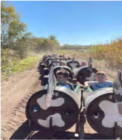
Sauchuk Farm cow train