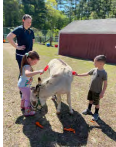
At the farm