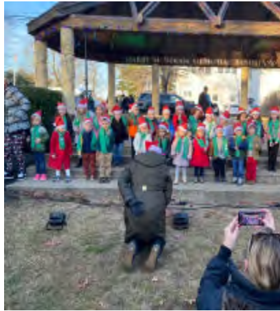
CNK choir at the tree lighting