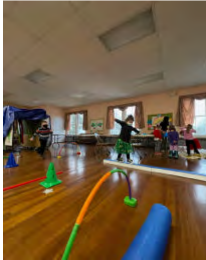
Gross motor play