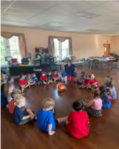
Students around the “campfire” at camp CNK